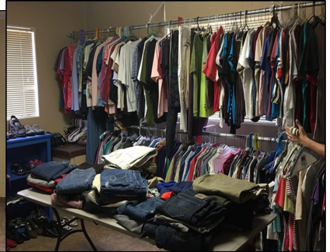
Providing Clothes for Free – at the Clothing Room