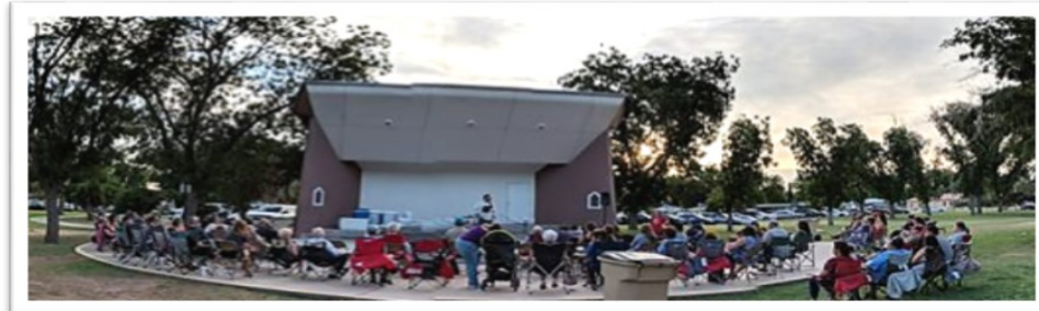
Church in the Park - July 2018